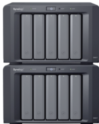
DX517 X 2